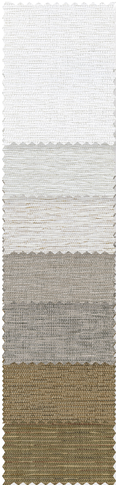
NEW S10 Bark / Eggshell