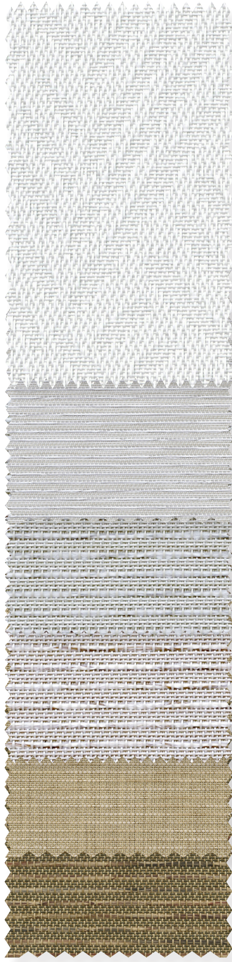
R05 Feather / Clear