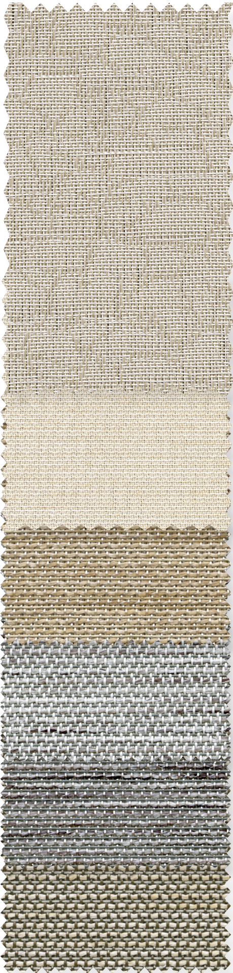
Q43 Marble / Sand