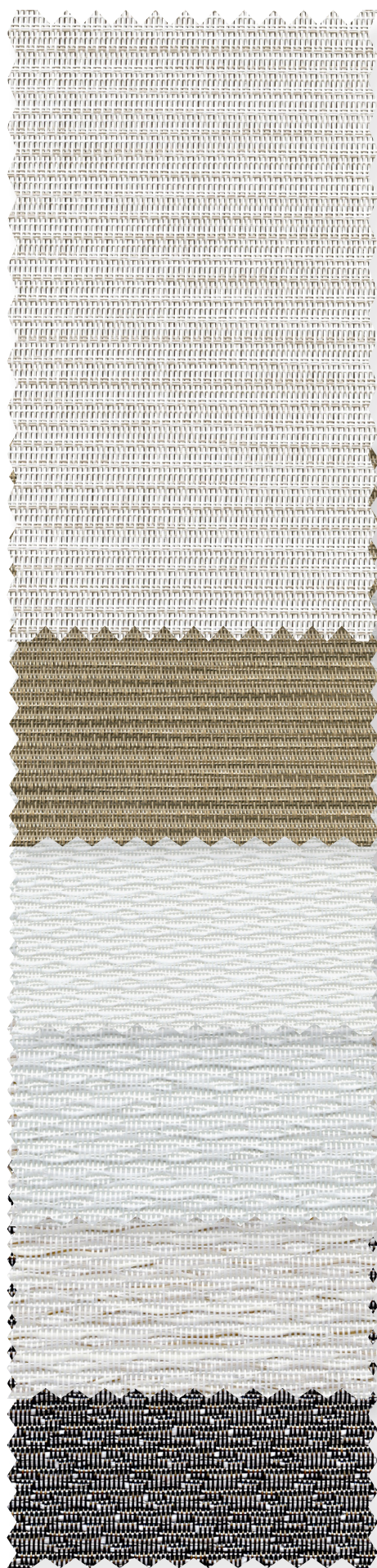
P60 Bamboo / Birch