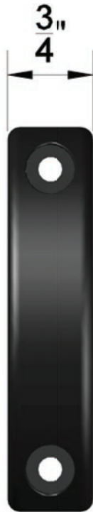
FRONT VIEW SCALE 1:1